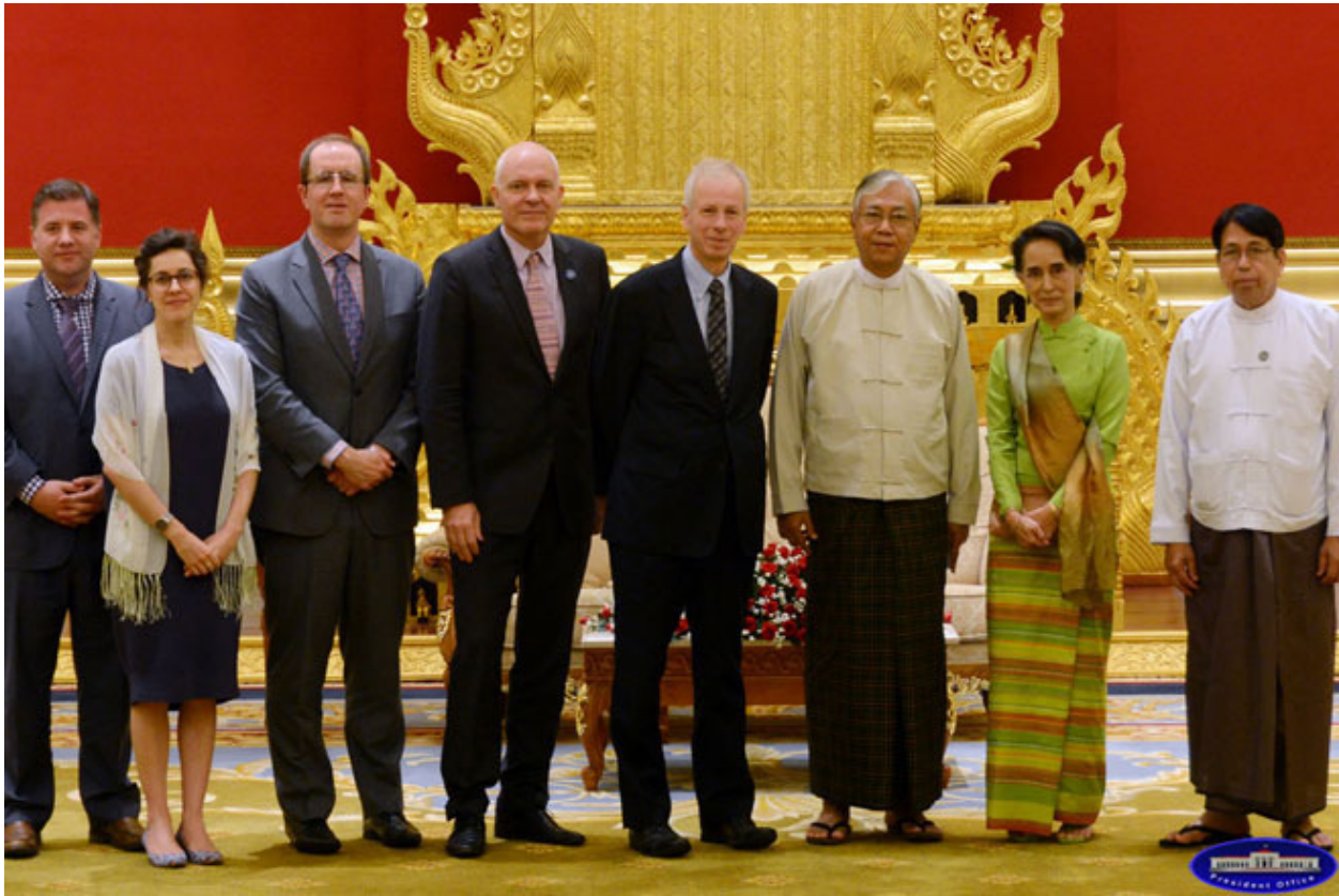
The Union Minister for Foreign Affairs of the Republic of the Union of Myanmar Daw Aung San Suu Kyi holds talks with the Canadian Foreign Minister H. E. Mr. Stéphane Dion on 7 th April 2016.