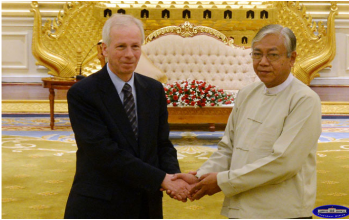
The President of the Republic of the Union of Myanmar H.E. U Htin Kyaw holds talks with the Canadian Foreign Minister H. E. Mr. Stéphane Dion on 7 th April 2016 at the President Office.